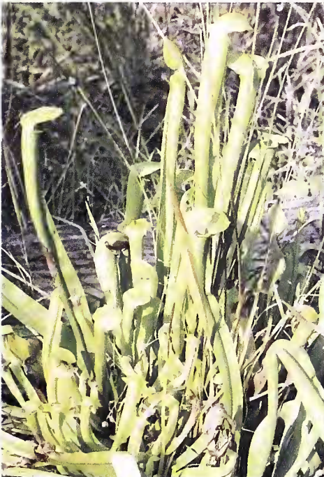
Figure 5: Sarracenia 'Super Green Giant'